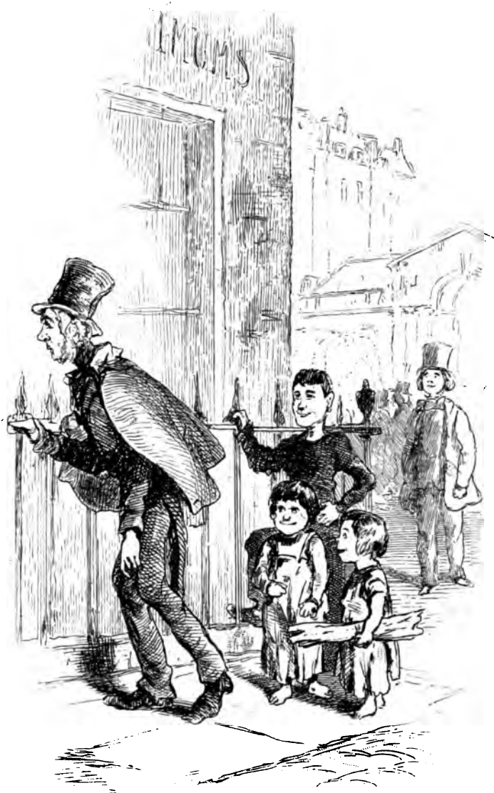
THE CAPTAIN WON'T GO HOME TILL MORNING